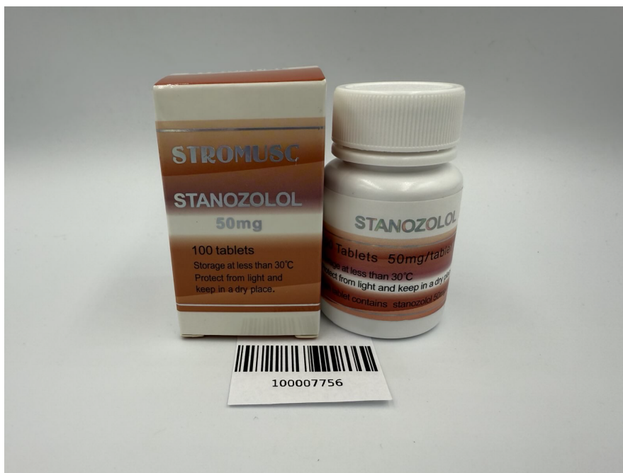
Photo of the test sample

The test sample was applied in the amount of 3 \mu l to the BioBasic 8 Thermo Scientific column. During the course of the analysis with the method a linear gradient in the solutions of H 2 O and Acetonitrile with the addition of 0.1% trifluoroacetic acid, a peak of the sought substance appeared. Its concentration, when compared to the reference chromatogram, is 49,19mg/tab. Height the measurement error is + - 0,05mcg. The actual state of the sample sent before the test is presented on the photo below