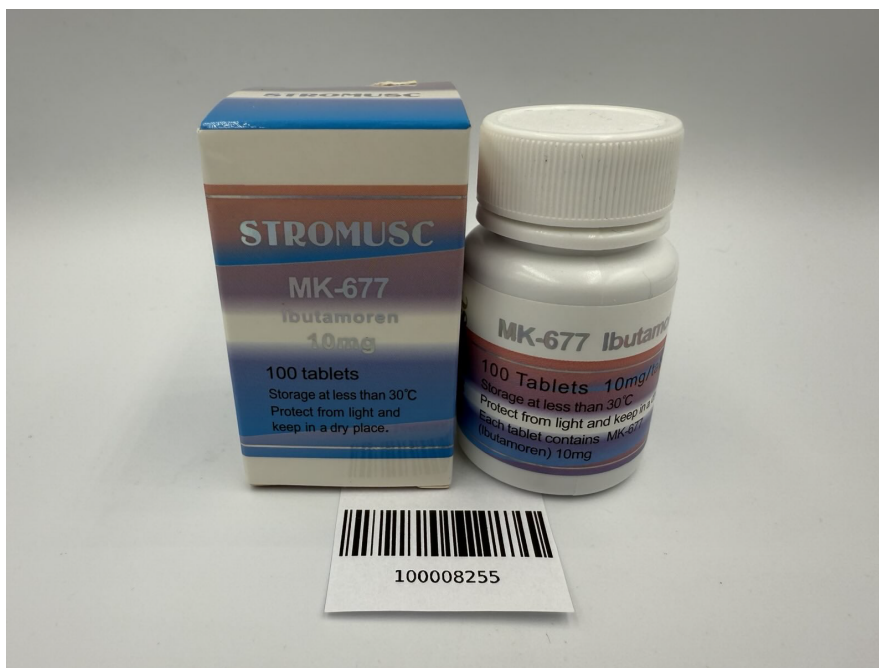
Photo of the test sample

The test sample was applied in the amount of 2 \mu l to the BioBasic 8 Thermo Scientific column. During the course of the analysis with the method a linear gradient in the solutions of H 2 O and Acetonitrile with the addition of 0.1% trifluoroacetic acid, a peak of the sought substance appeared. Its concentration, when compared to the reference chromatogram, is 10,28mg/tab. Height the measurement error is + - 0,05mcg. The actual state of the sample sent before the test is presented on the photo below