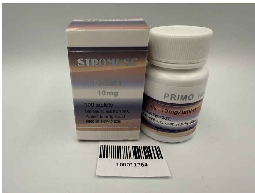
Photo of the test sample

The test sample was applied in the amount of 3 \mu l to the BioBasic 8 Thermo Scientific column. During the course of the analysis with the method a linear gradient in the solutions of H 2 O and Acetonitrile with the addition of 0.1% trifluoroacetic acid, a peak of the sought substance appeared. Its concentration, when compared to the reference chromatogram, is 10,10mg/tab. Height the measurement error is + - 0,05mg. The actual state of the sample sent before the test is presented on the photo below